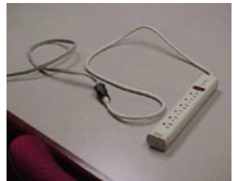
Figure 2: Mixed daisy chain—Powerstrip energized by an extension cord

90 days are considered permanent wiring. Unfortunately, once in place, extension cords tend to become permanent wiring and a fire hazard.