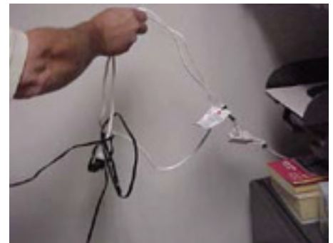
Figure 1: Daisy Chain—Interconnected extension cords

Extension cords are sometimes used to energize power strips in locations far from outlets. Because electrical resistance increases with increased power cord length, interconnecting cords increases the total resistance and results in heat generation. This creates an additional risk of equipment failure and fire, particularly when paper and other combustible materials are in contact with the wires. Additionally, OSHA’s regulations only allow extension cords to be used as temporary wiring for up to 90 days. Any cords in place over