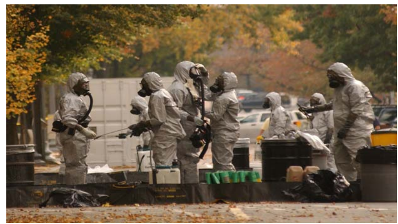
Decontamination After Exiting the Hot Zone