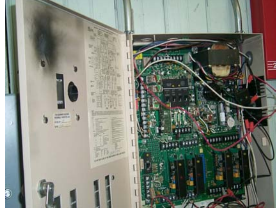
Fire Alarm Electrical Panel Requiring Repairs

Fire alarm systems either were not functioning, or were missing pull stations, or were not monitored and connected to a twenty-four (24) hour monitored station in eight (8) locations. These locations were in warehouses and other non-office facilities. Fires in workshops, garages or other non-office spaces can expose all employees in the Legislative Branch office buildings to the danger of serious injury or death.