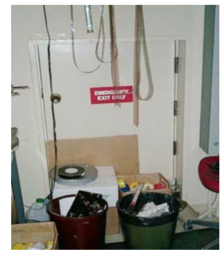
Emergency Exit from Projection Room Blocked

In twelve (12) locations including the Russell and Hart Senate Office Buildings and Capitol Police Headquarters, we found the exit routes contained doors or doors that did not close automatically to create a fire barrier and in one instance a padlocked exit door.