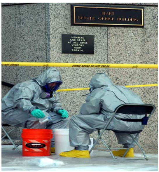
Hart Building Anthrax Response Workers