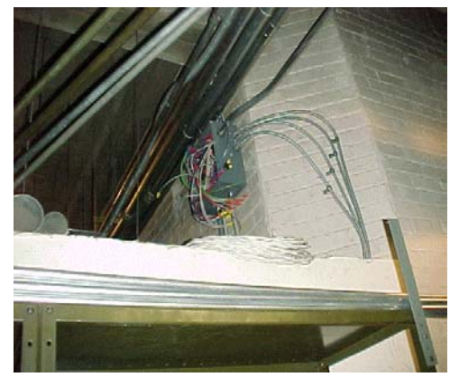
Electrical Junction Box with no Cover and Energized Wires

In thirty-three (33) locations we found electrical junction and switch boxes that were not fully enclosed in order to contain live wires, hot materials or sparks. This is a violation of the National Electrical Code and OSHA regulations, 29 CFR 1910.305(i)(3)(iv).