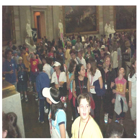
Crowding in the U.S. Capitol Rotunda

• Overcrowding of Capitol Building – Employees of the Capitol Guide Service submitted several Requests to us about overcrowding, noise and fire safety in the Capitol Building. Following our investigation, the Capitol Police Board implemented a plan limiting the number of tourists allowed in the building. However, many other fire safety issues in the Capitol Building, such as the audibility of fire alarms, and exit capacity, have not yet been resolved. We are advised that it may be five years