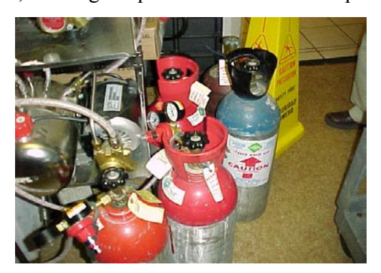
Unsecured Compressed Gas Cylinders

In thirteen (13) locations, including House and Senate Office Buildings, we found chemicals improperly stored, creating the potential for fire and explosion.