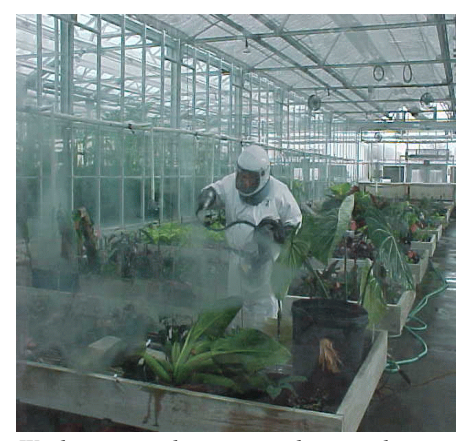
Working in wet locations with pesticides

fungal lung infections or other respiratory diseases which they attributed to their workplace use of herbicides, pesticides and other hazardous chemicals. Following OOC investigations, the Botanic Gardens discontinued the use of many hazardous chemicals and hired a full-time safety specialist. AOC also instituted a comprehensive respirator and approved personal protective equipment program in all facilities.