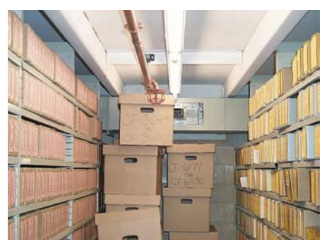
Stored materials prevent proper operation of fire sprinklers

In thirteen (13) locations, we found that fire sprinkler heads were blocked by either stored materials or ceiling tiles. Some heads had been damaged and required repair or replacement. The buildings involved were Dirksen, Cannon, Rayburn, Capitol Police Headquarters and, several other facilities.