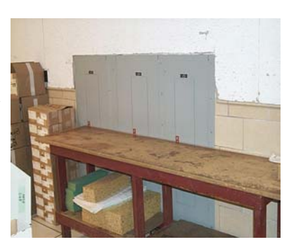
Blocked Electrical Cabinets Prevent Access in Case of an Emergency

The older House Buildings are configured with electrical breaker boxes located in the occupied office space. Access to the boxes was often blocked by desks, computers, bookcases and other heavy objects. In an emergency, quick unobstructed access to these boxes may be essential, in order to minimize the danger of electrocution or fire. Labeling the boxes "Electrical Box–Do Not Block" would help to minimize these blockages.