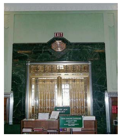
Conflicting Exit Signs for Doorway

In the LOC's Madison Building, a large number of the exit signs located within the Library's offices were improper and misleading. Apparently, this office space had been reconfigured after these exit signs were installed and many did not lead directly to the shortest and most direct route of exit. The exit signs for the public portions of the building generally appeared to be adequate.