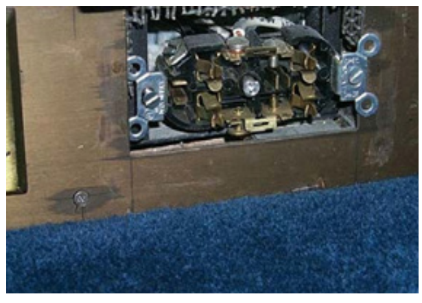
Broken wall-outlet was being used to power computer worksta-

✓ Bathroom outlets near the sink and in other wet floor and counter areas must have ground fault circuit interrupters (GFCI) protection. Test these GFCI's periodically in order to ensure that they trip properly to prevent electrical shock hazards. Test the GFCI's by pressing the test button and then after it trips, push the reset button on the GFCI so that electrical service is restored.