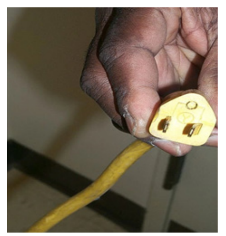
Appliance plug missing ground prong

✓ Ensure that office annunciators are working properly and kept fully charged for emergency use. Reset them after each use.