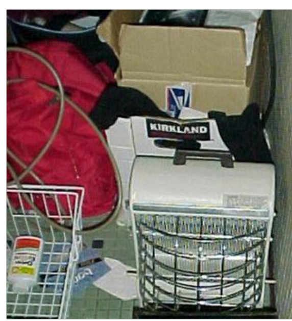
Figure 1: Space heater surrounded by combustible materials

Although space heaters appear to be harmless to some, many hazards can still exist no matter where they are used. In 2005-2009, space heaters caused 32% of home heating fires or structural fires and resulted in thousands of injuries as well as civilian deaths. (See "Fast Stats" on Page 3) The most serious hazards associated with space heaters are fire hazards. The majority of space heater fires are caused when combustibles (e.g. paper, clothing, and curtains) are placed too close or come in contact with the heater causing them to catch fire. Portable electric space heaters have a higher risk of fire than fixed electric heating devices.