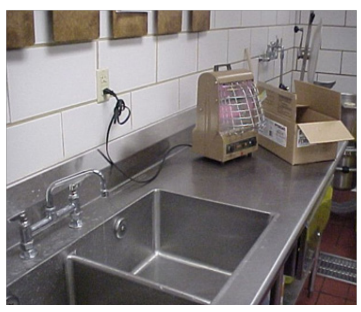
Figure 3: Space heaters should not be used near a sink, as seen above, or near combustible materials