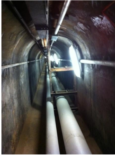
Upgraded lighting in utility tunnel

performed during the 112 th Congress, including egress installations and upgrades, continuing concrete removal, signage installation, and inspection program development and implementation. We anticipate that the necessary work will be completed before June 2012.