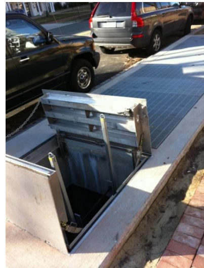
Upgraded egress hatch and ventilation

A comprehensive settlement was approved in June 2007 by a hearing officer appointed by the Executive Director of the OOC. It requires the AOC to abate all high risk (RAC I and RAC II) hazards in the tunnel system by June 2012. Further, it mandates regular inspections and quarterly reports by the AOC, and monitoring by the OGC. During the 111 th Congress, our monitoring revealed significant progress in reducing hazards by means of egress installation, concrete and structural improvements, ventilation system installation, and electrical and lighting upgrades. Many projects are underway for work to be