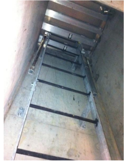
New egress, ladder, and hatch