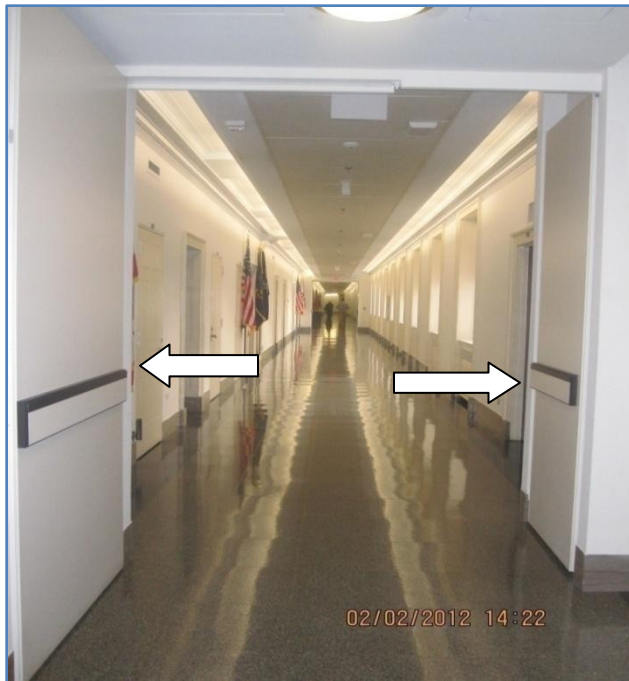
Longworth Cross-Corridor Doors in Open Position

After being notified that the OOC General Counsel was contemplating additional enforcement action, 44 the Architect developed a detailed plan known as the Senate Alternative Life Safety Approach ("SALSA") to abate the hazards posed by the unprotected exit pathways, insufficient emergency exit capacity, and excessive exit travel distances, all conditions that fail to comply with the life safety objectives. SALSA addresses the emergency evacuation deficiencies and historicity issues by creating protected horizontal exit pathways through the use of solid cross-corridor doors. These doors lie flush against the corridor walls and only close when an evacuation alarm is activated. Because the doors are located in the corridors, they do not encroach on office space and can be installed without relocating or disturbing Senate offices. When closed, the doors create separate zones within the building that isolate fire and airborne toxins within one zone; consequently, Senators, staff, employees and visitors are able to quickly escape the zone where the danger is located by moving into an adjacent zone that is protected by the doors against the rapid spread of fire and airborne toxins. 45 The Architect's historian found