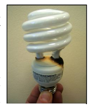
Figure 2:Burnt out CFL

Fluorescent lamps contain a small amount of mercury vapor - approximately 5 milligrams sealed within the glass tubing. Mercury, at atmospheric pressure, is a silver colored liquid that tends to form balls. Mercury is a hazardous substance that can be inhaled, absorbed through the