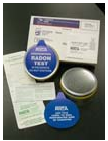
Figure 3: Commercially available home radon test kits.

The Office of Compliance has tested underground facilities in the Legislative Branch Campus and has found radon levels well below both the EPA guidelines and the OSHA exposure standards. We join with the EPA and the Surgeon General of the United States in strongly suggesting that each employee have his or her home tested.