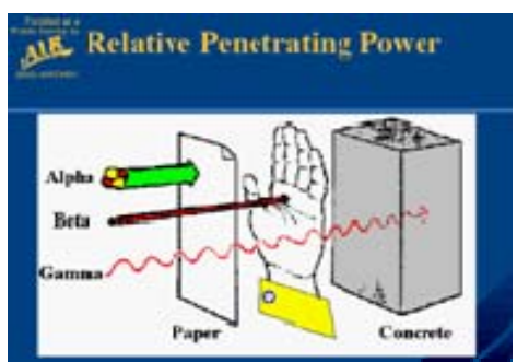
Figure 2: Alpha particles have limited penetration.

for exposure to radon gas. The Occupational Safety and Health Administration (OSHA) has a work-place exposure limit of 100 piCi/L for 40-hours over 7 consecutive work days (29 CFR 1910.1096(c) (1)). The EPA has set a standard for radon gas in the air in homes at 4 piCi/L and in water at 300 piCi/L.