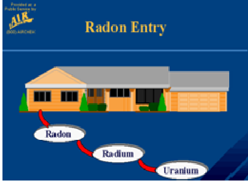
Figure 1: Decay products and vapor pathways of radon into homes and buildings.

Uranium, which is naturally radioactive, is found in rock in various locations around the world. Whether or not an area of the country has the potential to have measurable levels of radon is a function of local geology. The United States Environmental Protection Agency (EPA) periodically publishes updated maps of the location of uranium-bearing rocks and sediments and the likelihood of finding measurable levels of radon inside buildings built over these formations. This website (http://www. epa.gov/iaq/whereyoulive.html) can provide you with the estimated